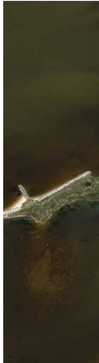
TOP PHOTO: Harris sees a sea horse or bear in this photo of a point off Flatty Cove, on the Tred Avon River. Sure, we see that, but first we see an angel fish swimming left to right.